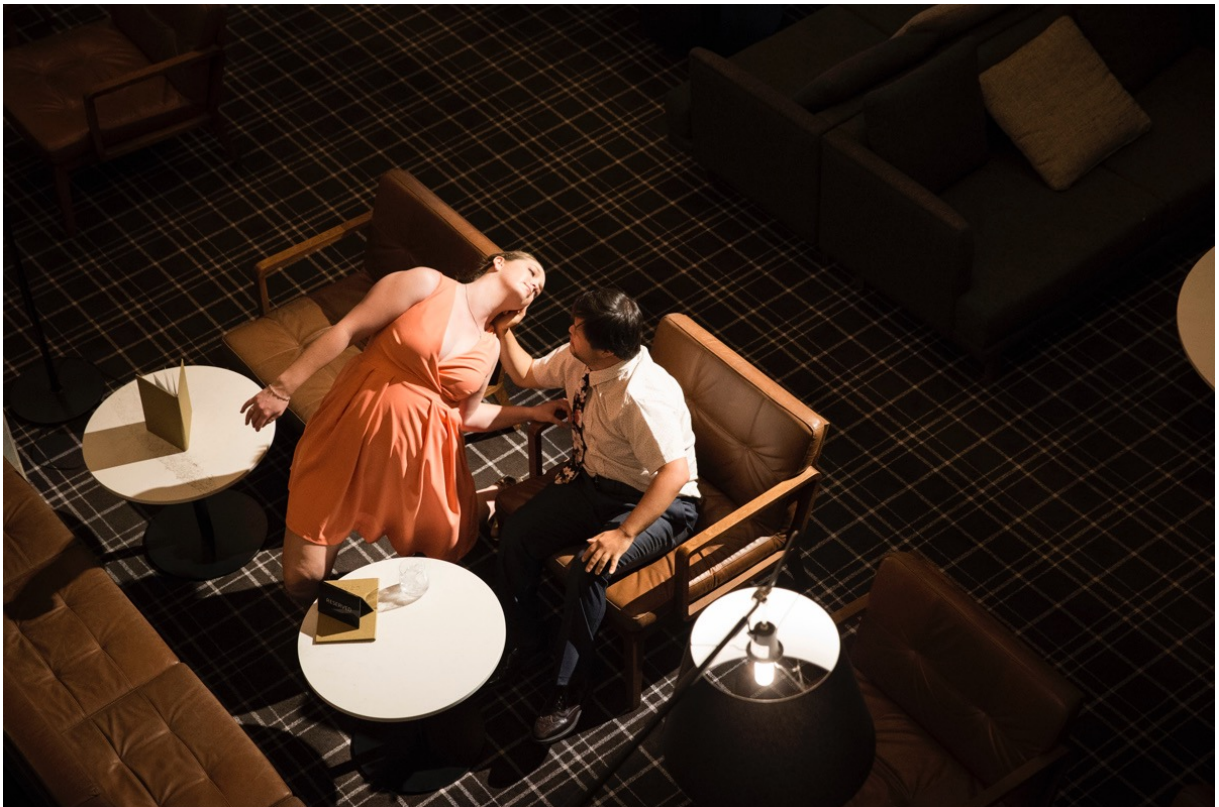
Photo: Bar Scene