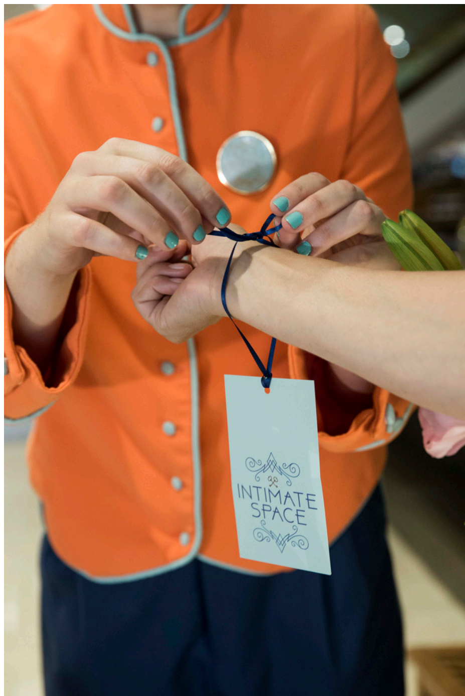
Photo: Check in