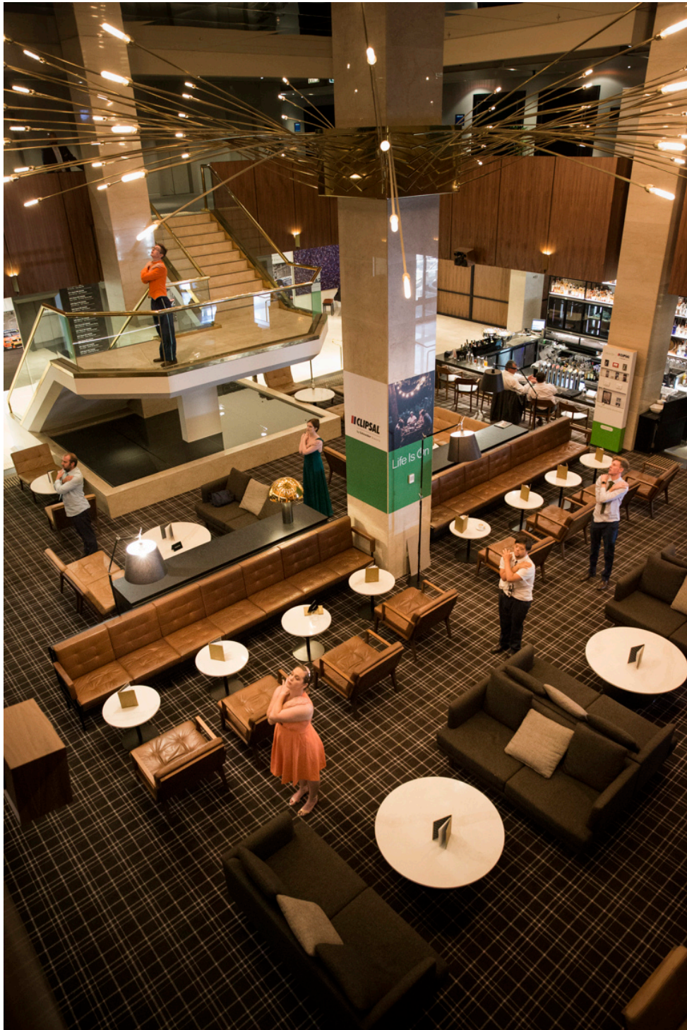
Photo: Bar Scene

DVD's to accompany the Education Guide can be purchased from Restless Dance Theatre