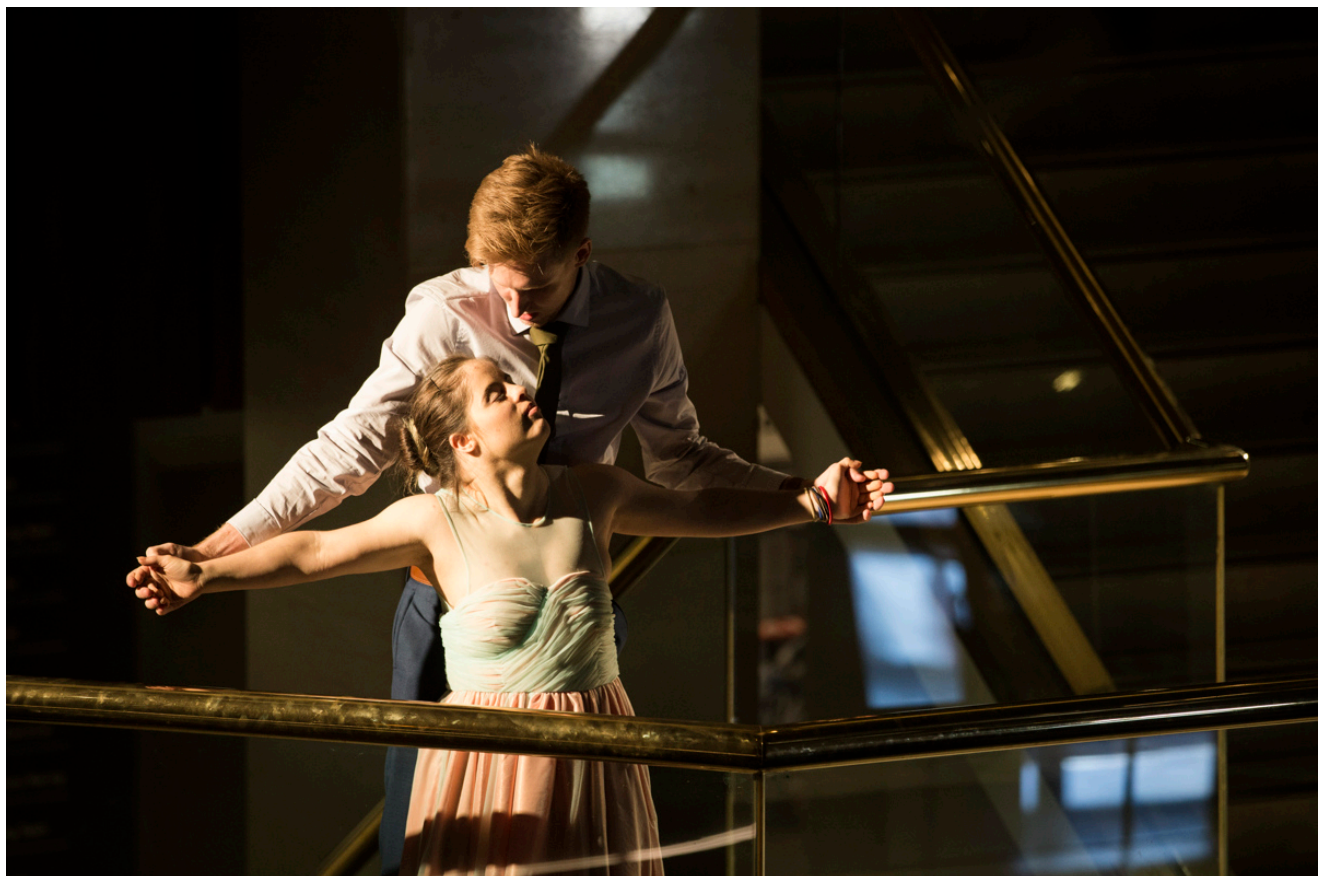
Photo: Whispering duet, the balcony

Restless has also received an award for Outstanding Achievement in Youth or Community Dance at the Australian Dance Awards in 2010 and an SA Ruby award for Sustained Contribution by an Organisation. In 2015 Restless Dance Theatre was nominated for Outstanding Achievement in Youth for Salt at the Australian Dance Awards.