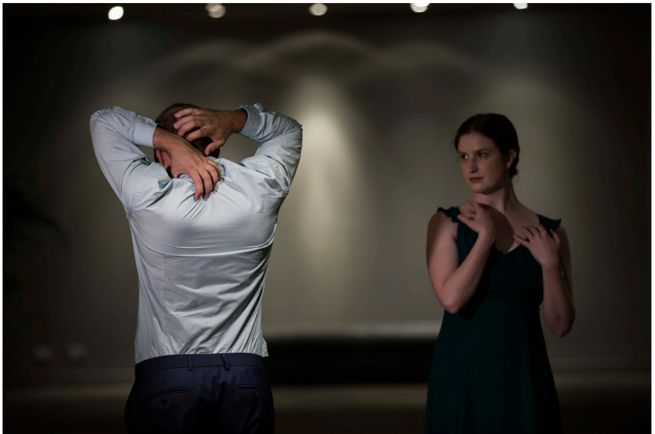
Photo: The Tense Couple